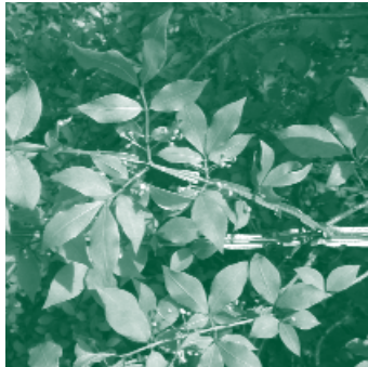
Burning bush ( Euonymus alatus )