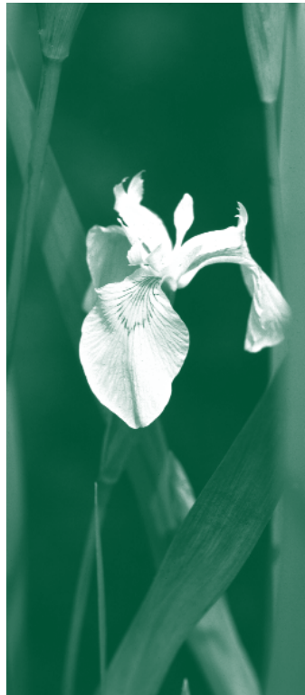
Yellow flag iris ( Iris pseudacorus )