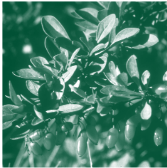
Japanese barberry ( Berberis thunbergii )